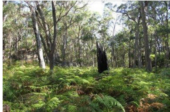
New England blackbutt – messmate stringybark – Sydney blue gum forest