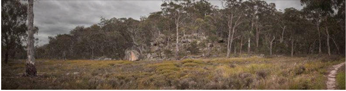
Montane peat wetland.