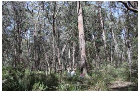
New England stringybark – apple box – silvertop stringybark forest

New England peppermint ( Eucalyptus nova-anglica ) – wattle-leaved peppermint ( Eucalyptus acaciiformis ) – stringybark ( Eucalyptus subtilior ) woodland and forest is restricted to lower slopes on moist, deep sedimentary soils in the north and north east of the property. This vegetation community is listed as an endangered ecological community under the NSW Threatened Species Conservation Act 1995 . It is also listed as a critically endangered ecological community under the Commonwealth Environment Protection and Biodiversity Act 1999 .