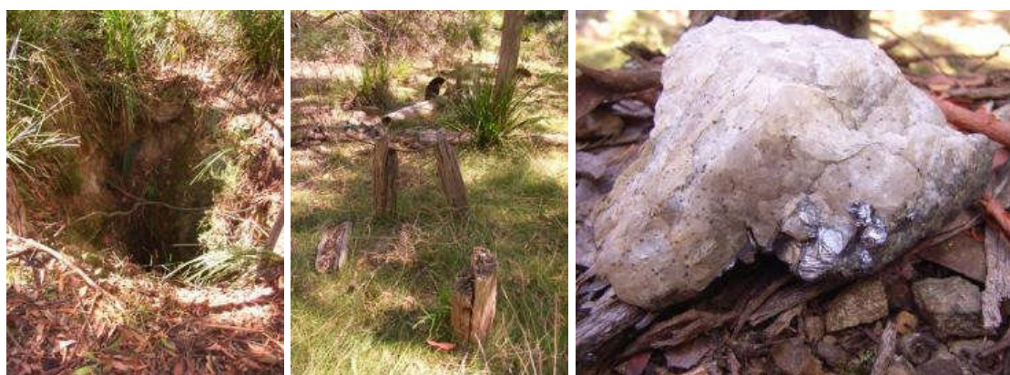
From left: Old mining shaft, old mining infrastructure and molybdenite from tailings at Bezzants Lease

The Land is largely unmodified and has been vacant for around 20 years. There has been some selective logging, mainly in the forest close to the tracks, and possibly some small areas of clearing in the past. Old mining shafts in the north are relics of past mining for molybdenite.